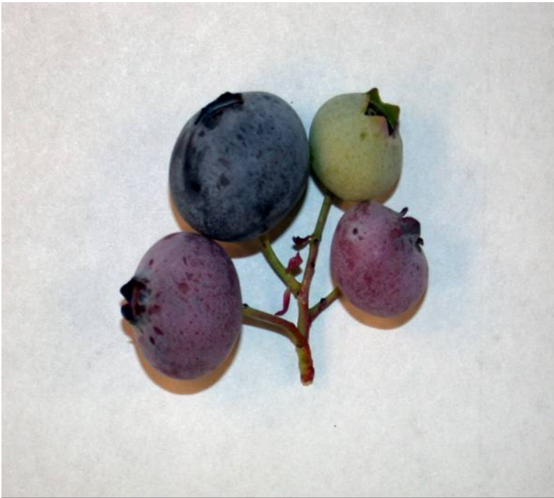
Figure 1.1. Blueberries at white, pink and blue stages after the start of final swell (stage 3).

increase (3). As berry color changes from green to white to pink to blue (Figure 1.1) the berries increase dramatically in size (final swell) (3, Lyrene, personal communication). It takes about 5 days for the berries to undergo this ripening process for a climacteric fruit, physical maturity is reached at mature green stage (i.e., when it can ripen on or off the plant). to become fully ripened, physiologically mature blueberries (Lyrene, personal communication).