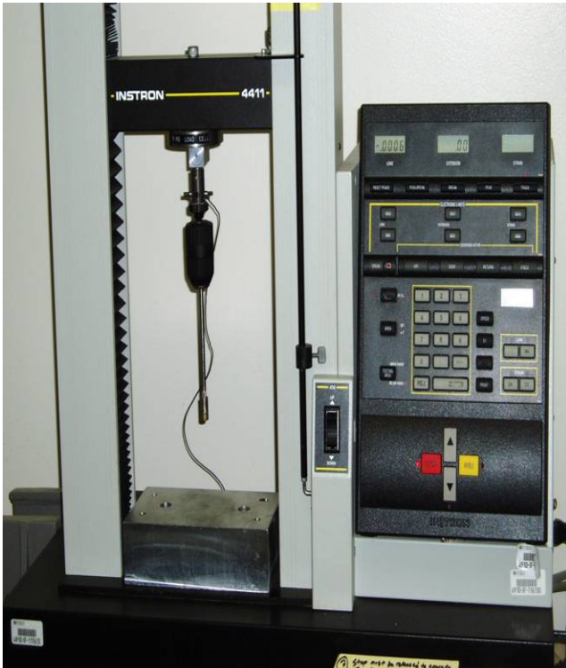
Figure 2.1. Instron machine with 8 mm probe.

for 90 minutes to allow the berries to reach room temperature (about 22°C). Once at room temperature, the berries were inspected for leaking, collapse, decay or other damage. Damaged berries were discarded, after which 10 berries were randomly selected from each clone for firmness testing. An Instron 8600 with a 10 N load cell was used to test firmness. Each berry was placed onto a washer with an outer diameter of 2.2 cm and an inner diameter of 1 cm to keep it stable. The berries were placed on their sides with the calyx end to the left and the stem end to the right. An 8 mm probe attached to the Instron was then lowered from above until it pressed onto the equator of the berry, using an initial contact force not exceeding .03N (Fig. 2.1). Using a crosshead speed of 50 mm/min, each berry was deformed and the 3 mm deformation at 1 mm, 2 mm, and 3 mm depth were recorded (10 berries/clone).