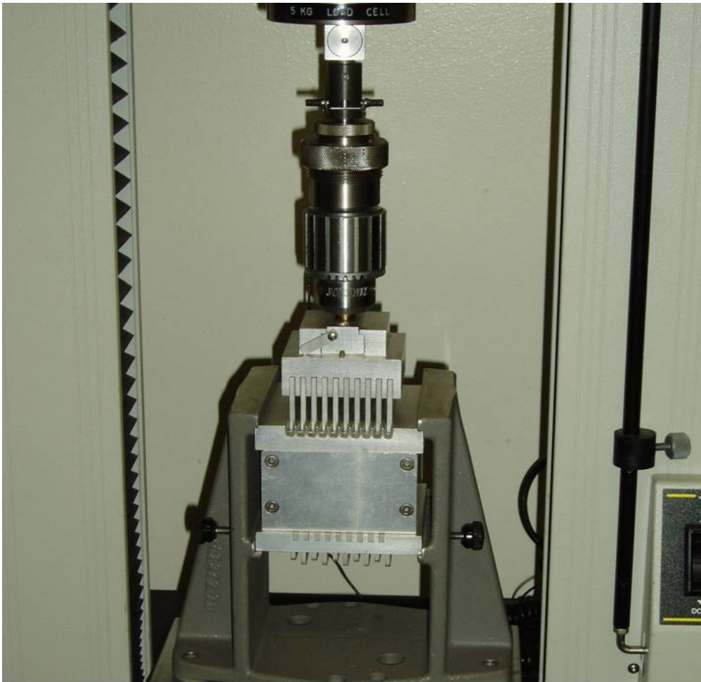
Figure 2.3. Instron 8600 with shear-cell attached.

textured blueberry clones and four standard commercial clones. In the early harvest, the firmest four clones in descending order were FL 97-136, 'Bluecrisp', FL 00-59 and FL 00-180 (Fig. 2.4). At the 5% level 'Bluecrisp', FL 97-136, and FL 00-59 were different from all other clones except FL 00-180. FL 00-59 was not significantly