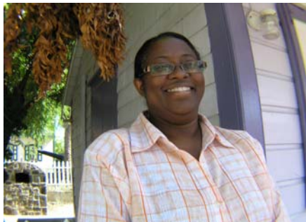
Article by Ms. Audrey Sandries

In late 2007 the former Minister of Justice, Minister David Dick after consultations with the respective Executive Councils took the decision to revise the execution of the Foreign policy of the Netherlands Antilles. Although in 2006 the policy was revised and the security measures and the checks and balances had been tightened and updated. In practice the operational (management) procedures were bureau-