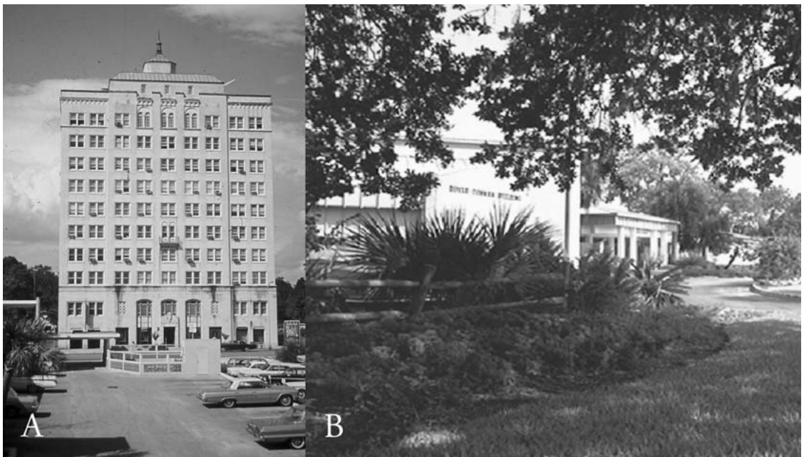
Fig. 2. The Seagle Building (A) and Doyle Conner Building (B) in Gainesville, Florida successively housed the State Plant Board.

In addition to intentionally introducing insects for whatever purpose, some pests have arrived accidentally on agricultural products. The gypsy moth, Lymantria dispar (L.), was imported into the Northeast from Europe in about 1869 to improve silk production. Egg masses are routinely found in Florida on campers and travel trailers that arrive in the fall from infested areas. However, due to Florida's warm climate, this pest does not become established. The European corn borer, Ostrinia nubilalis (Hubner), was accidentally introduced in about 1908 on broomcorn from Italy or Hungary. By 1938, it had spread over practically all of New England. It reached the Florida Panhandle in 1975 when it was found in seven counties by DPI inspectors. The Japanese beetle, Popillia japonica Newman, was introduced into