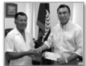
Minister of Tourism Hon. Manuel Heredia with Mr. Arturo Vasquez from the Belize Red Cross

This conference provides Belize with a tourism opportunity to further influence Central American visitors which is an emerging market for Belize. The BTB is pleased to welcome these delegates to Belize and wishes them much success with this 2009-2010 conference.