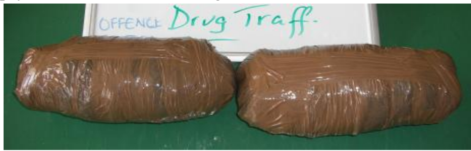
The Two Parcels Of Marijuana

He was unable to come up with the fine and was consequently transported to the central prison in Hattieville until the fine is paid or until the jail term expires, whichever comes first.