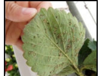
Figure 3. Strawberry leaflet showing high levels of parasitism. Brownish aphids are called "mummies", which are aphids that have been parasitized. Tiny wasps are expected to emerge.