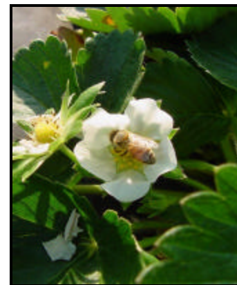
Bees are essential for cucurbit production.

For more information regarding beneficial insects visit the EDIS website at http://edis.ufl.edu .