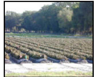
Timely crop destruction prevents future problems.