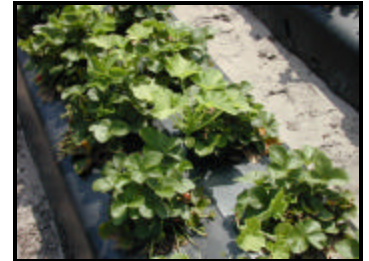
Intercropping trial at GCREC-Dover.

of what occurs in a commercial farming operation that is trying to maximize the use of materials and spread costs out over more than one crop.