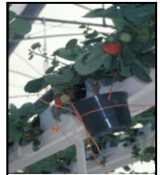
Figure 2. Strawberry plant infested with tiny wasps. Pot attached to the trough suspended in the air. Wasps are species-specific.