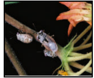
Figure 1. Adult and immature instars of the "big eyed bug", Geocoris punctipes , predator of a wide variety of pests.

In a complete biological control program, tactics range from the use of chemicals that are the least detrimental to beneficials to the release of beneficials as "biological insecticides". All these methods, as part of an IPM program, will require biological and ecological information to be successful. Results from the latest research should encourage greenhouse growers and the private sector to consider biological control as an alternative pest management system.