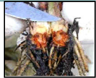
Evidence of crown rot.

Crop destruction is recommended for the suppression of Colletotrichum species, and is useful in the battle against other pathogens, insects, nematodes, and weeds as well. In these days of dwindling supplies of methyl bromide and increasing restrictions on fumigants, this "broad spectrum" opportunity should not be missed.