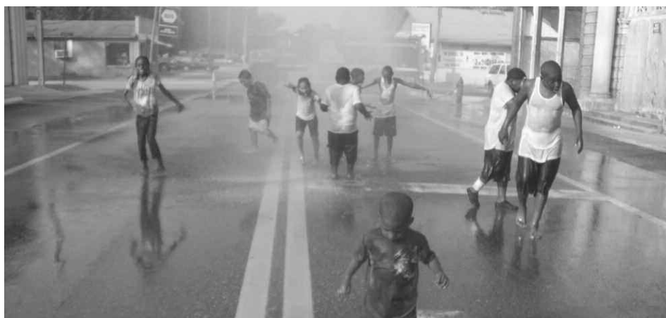
Empowering Tabernacle House of Prayer Outreach Ministry teamed up with the Town of Jennings for a recent celebration. ETHOP's Youth Department enjoyed some cool fun as part of the day's festivities.