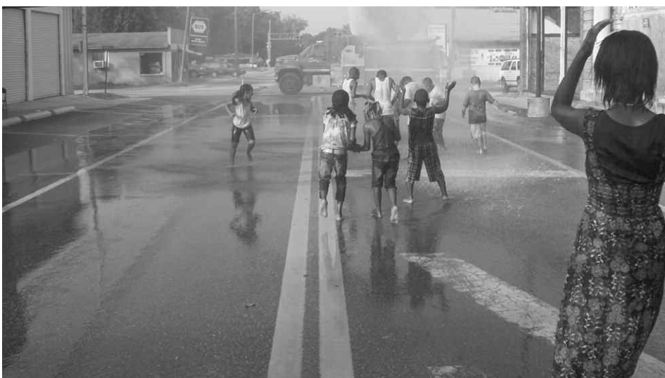
Empowering Tabernacle House of Prayer Outreach Ministry teamed up with the Town of Jennings for a recent celebration. ETHOP's Youth Department enjoyed some cool fun as part of the day's festivities.