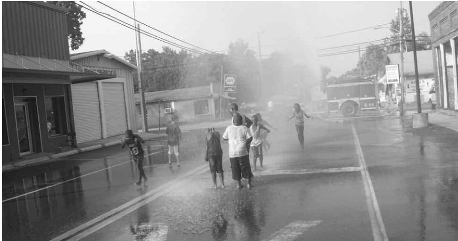
Empowering Tabernacle House of Prayer Outreach Ministry teamed up with the Town of Jennings for a recent celebration. ETHOP's Youth Department enjoyed some cool fun as part of the day's festivities.

What an awesome day of fun - not only for the City of Jennings residents, but for the youth and members of Empowering Tabernacle House of Prayer Outreach Ministry Apostolic Faith.