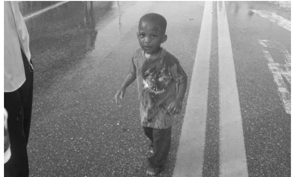
Empowering Tabernacle House of Prayer Outreach Ministry teamed up with the Town of Jennings for a recent celebration. ETHOP's Youth Department enjoyed some cool fun as part of the day's festivities.