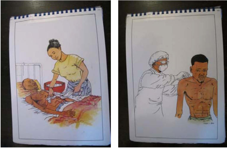
Figure 1. Images from a visual aid used in a public health campaign in DRC compare dangerous with protected caregiving of a patient with Ebola (LNSP/MSASF and France Cooperation N. d.).

of hunting) and developing strategies to curtail outbreaks through quarantine (see Figure 1).