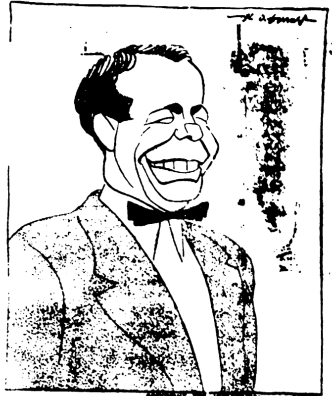
Young Teddy is handicapped by being the son of a great man. To prove that he really is a Roosevelt, he is doing the unexpected, joining Old Man Custom by making a record of his own. After an education according to orthodox Harvard fashion, he got into the navy as a director in several large corporations. When "T. R." was sent out of France (for fear the war would be won too soon) young Teddy went instead, adding another Colonel to the family. That being settled, he came home decorated with French medals and German bullets. Resuming his directorate to become a member of the New York assembly, he followed in his father's footsteps by becoming Assistant Secretary of the Navy. Young Teddy is actively interested in the Boy Scouts, American Legion, Scientific and Social clubs. In other words the Country still has a "Colonel Roosevelt."