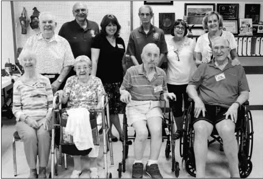
Special to the Riverland News American Legion Post No. 58 recently hosted veterans residing at Pacifica Assisted Living Center for dinner. Shown are the veterans and guests, Pacifica activity directors and two members of Post No. 58. A delicious pork dinner with tasty cupcakes for dessert was enjoyed by all.