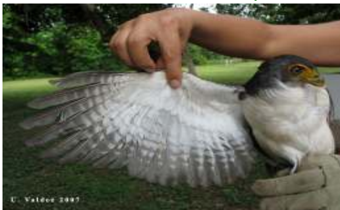
Figure 1. Young Forest Falcon