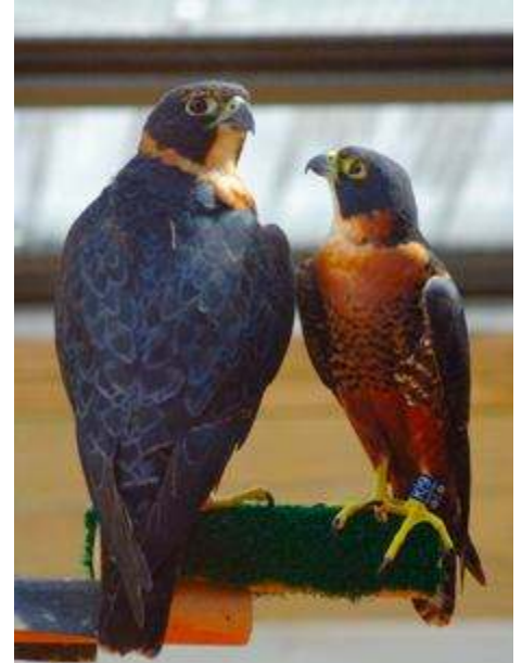
Pair at the breeding facility in Wyoming

These beautiful, medium-sized falcons once resided in tropical forests from southeastern Mexico through Central America to Peru, Bolivia, Paraguay and northern Argentina. Orange-breasted Falcons may be one of the most sparsely distributed falcons in the world. They feed on smaller birds and bats, pursuing them at high speeds and catching them in the air. The falcons generally nest on precipitous cliffs like the Peregrine Falcon and occasionally in emergent trees. The Orange-breasted Falcon has a white