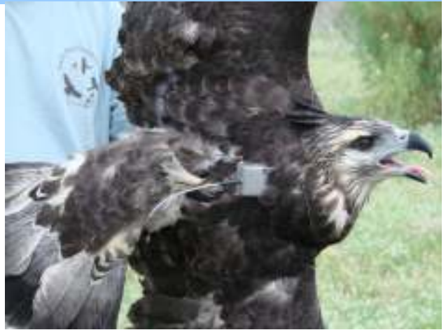
Crowned Solitary Eagle fledgling with transmitter.

An environmental education campaign is being implemented among the local residents with talks at rural schools and surveys among residents and workers at the area. This is so that we can find out what their feelings towards the species are and collect information about nest locations. Brochures have been distributed and a documentary titled "Crying Eagle" has been made for use at schools. This is the story of a child (Fernando) and his relationship with a Crowned Solitary Eagle. This documentary was made possible through an award from the National Film and Audio-visual Arts Institute of Argentina (INCAA) and the Sub-secretary of Culture of the government of La Pampa.