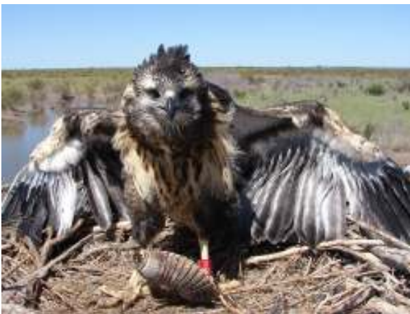
Crowned Solitary Eagle ( Harpyhaliaetus coronatus ) banded fledgling at a nest in Prosopis caldenia tree ( Prosopis caldenia ).

The Crowned Solitary Eagle ( Harpyhaliaetus coronatus ) is considered endangered, although its conservation status is still unknown. Researchers point to habitat loss and direct persecution by humans as the most serious threat to the population but none of them has been thoroughly investigated. One of the main factors that limit the analysis of these causes is the limited knowl-