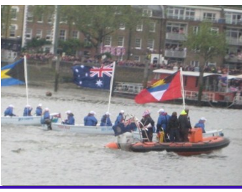
Antigua and Barbuda's flag flying on Flotilla during Thames Diamond Jubilee Pageant