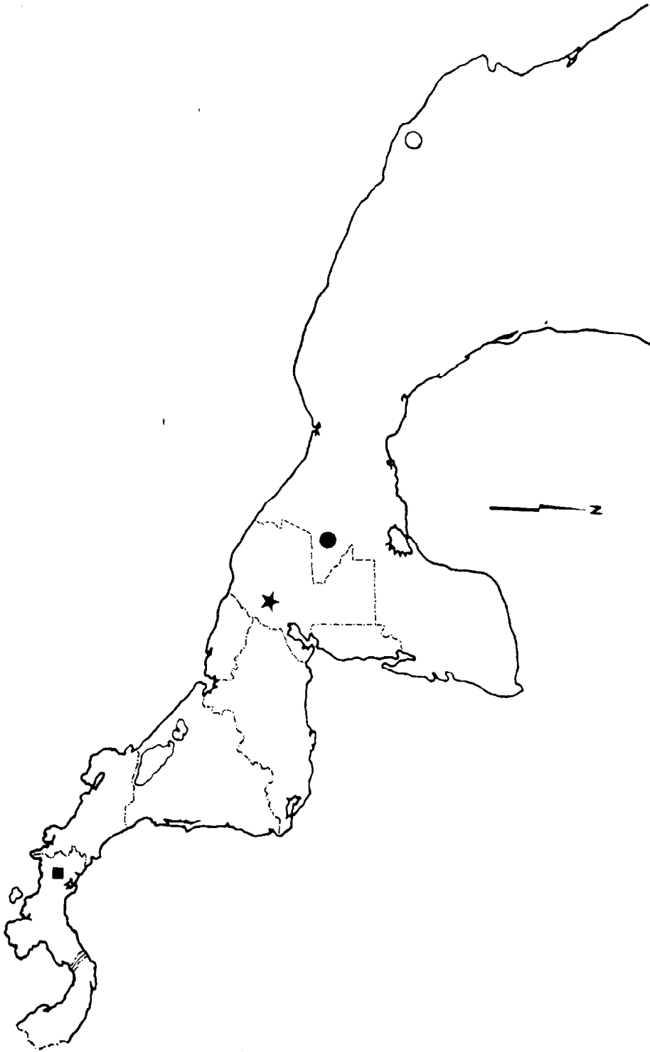
Fig. 1. Distribution of 4 new species of Petrejoidea : open circle— P. michoacanae , dark circle— P. chiapasae , star— P. pokomchii , square— P. panamae .