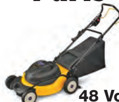
48 Volt CC 500 Battery