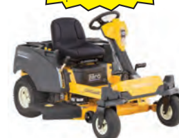
RZT S 42"-46"-50"