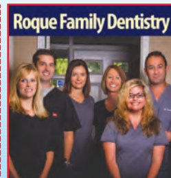
"And the friendliest staff on the Treasure Coast"

ROQUE FAMILY DENTISTRY 1956 41st Ave Suite D, Vero Beach 772-778-1040