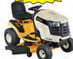
LTX (KW) Series 1000