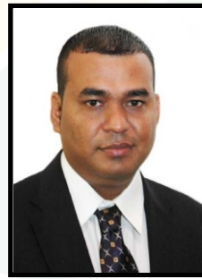
Robert Montgomery Persaud

From 1994 to 2001, he served as Chancellor of the University of Guyana and upon completion he assumed the position of Minister of Foreign Affairs.