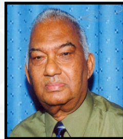
Doodnauth Singh S.C., M.P.