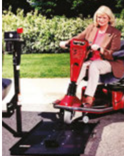
Trailer Hitches Running Boards