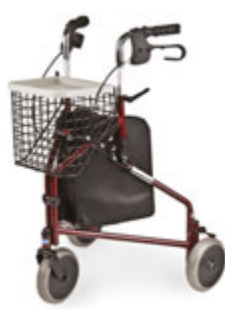
3 and 4 Wheel Walkers