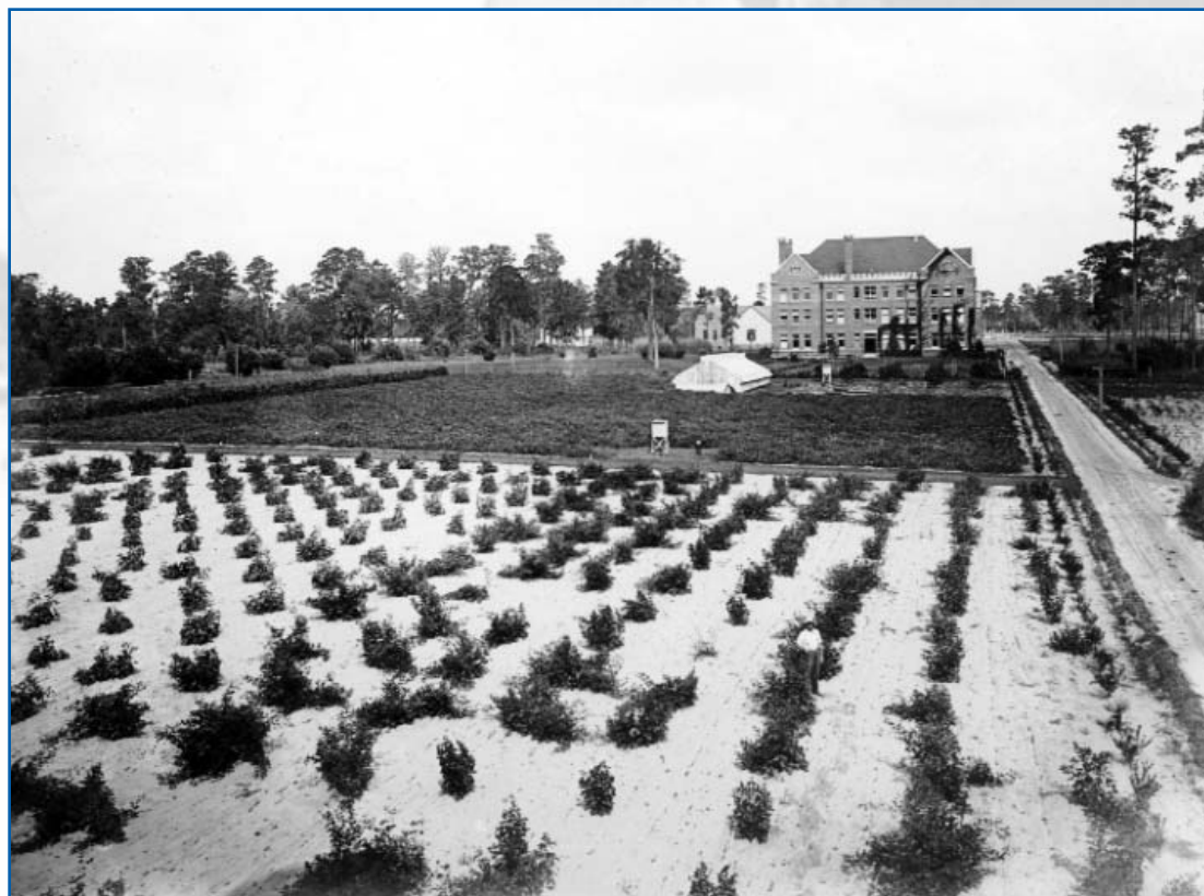
Newell Hall, the early Florida Agricultural Experiment Station.

In 1985, UF was added to the Association of American Universities, a prestigious higher-education organization comprising the top 63 public and private institutions in North America. UF's placement recognized outstanding research and education programs in agriculture and natural resources, engineering, medicine, business and law.