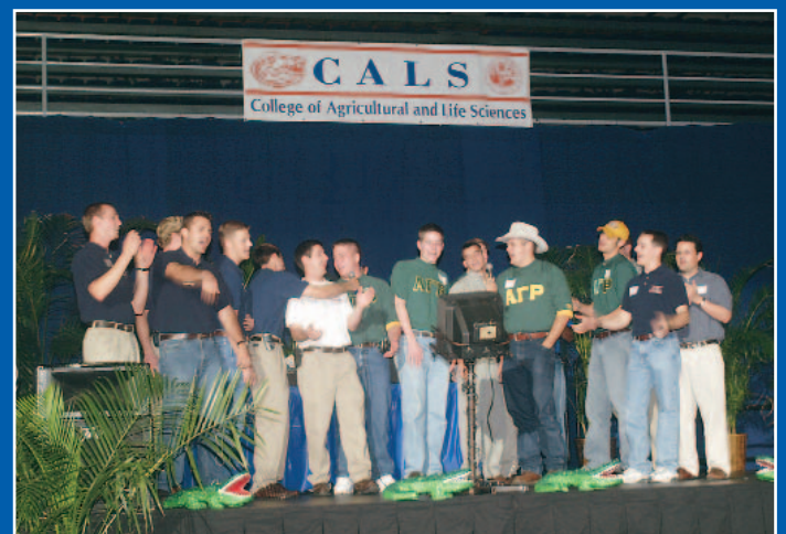
Alpha Gamma Rho brothers compete for the Dean's Award in the annual karaoke contest.