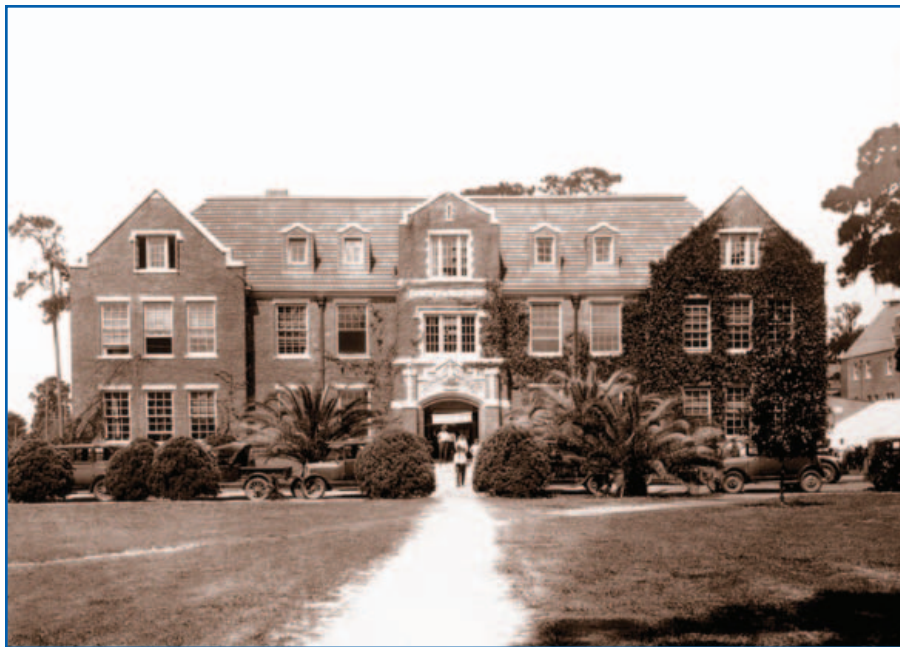
The original College of Agriculture building, Floyd Griffin Hall.

The history of Florida’s environmental horticulture industry dates back to 1881, when the first