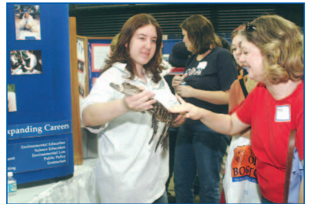
A wildlife ecology and conservation student acquaints Gator Encounter participants with a baby alligator.