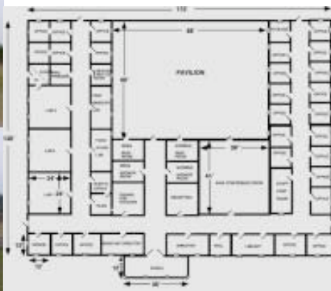
Pictures of the current LAKEWATCH facilities and a diagram of the proposed new building.