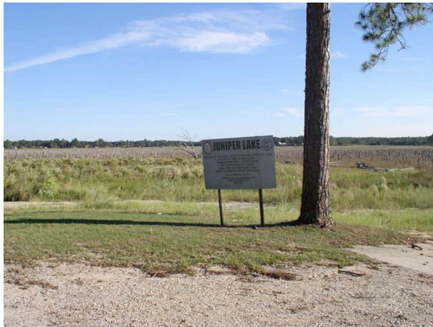
Juniper Lake in Walton County after several months of severe drought in the Florida panhandle.

pottery, five boats and a number of human bone fragments. Most of the bones were extremely fragmented and were estimated to be 500 to 1000 years old. Because of the estimated age of the fragments the state has alerted the Seminole and Miccosukee tribes of the bones. The five boats were considerably younger and included a steam powered dredge, possibly used to dig canals, a steamship, a wooden motorized canoe and a catfish boat from the early 1900's.