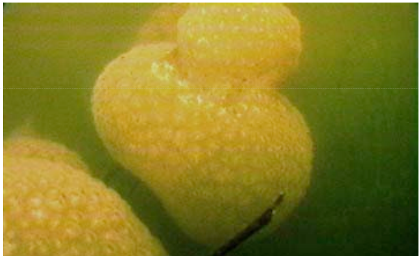
Pectinatella magnifica growing attached to a submersed surface.

and grates of hydroelectric plants. If your lake water is not used for irrigation or cooling power plants then Pectinatella magnifica should not be a nuisance, just another marvelous curiosity of your lake