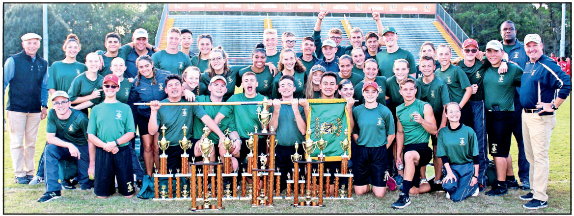
Nease High School's NJROTC team celebrates winning its sixth consecutive Mandarin Drill Meet championship Nov. 17.