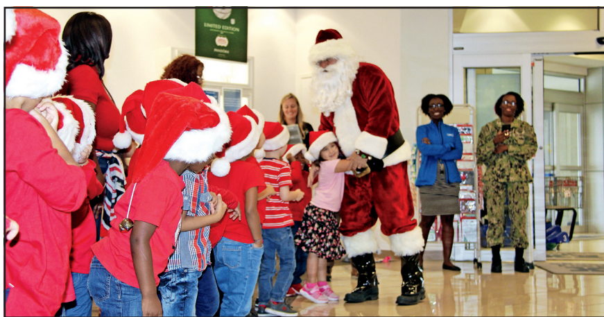
Children from the Naval Air Station Jacksonville Child Development Center excitedly greet Santa Claus as he makes his way into the Navy Exchange during the annual USO Giving Tree event.

The USO works with base tenant command master chiefs to com-