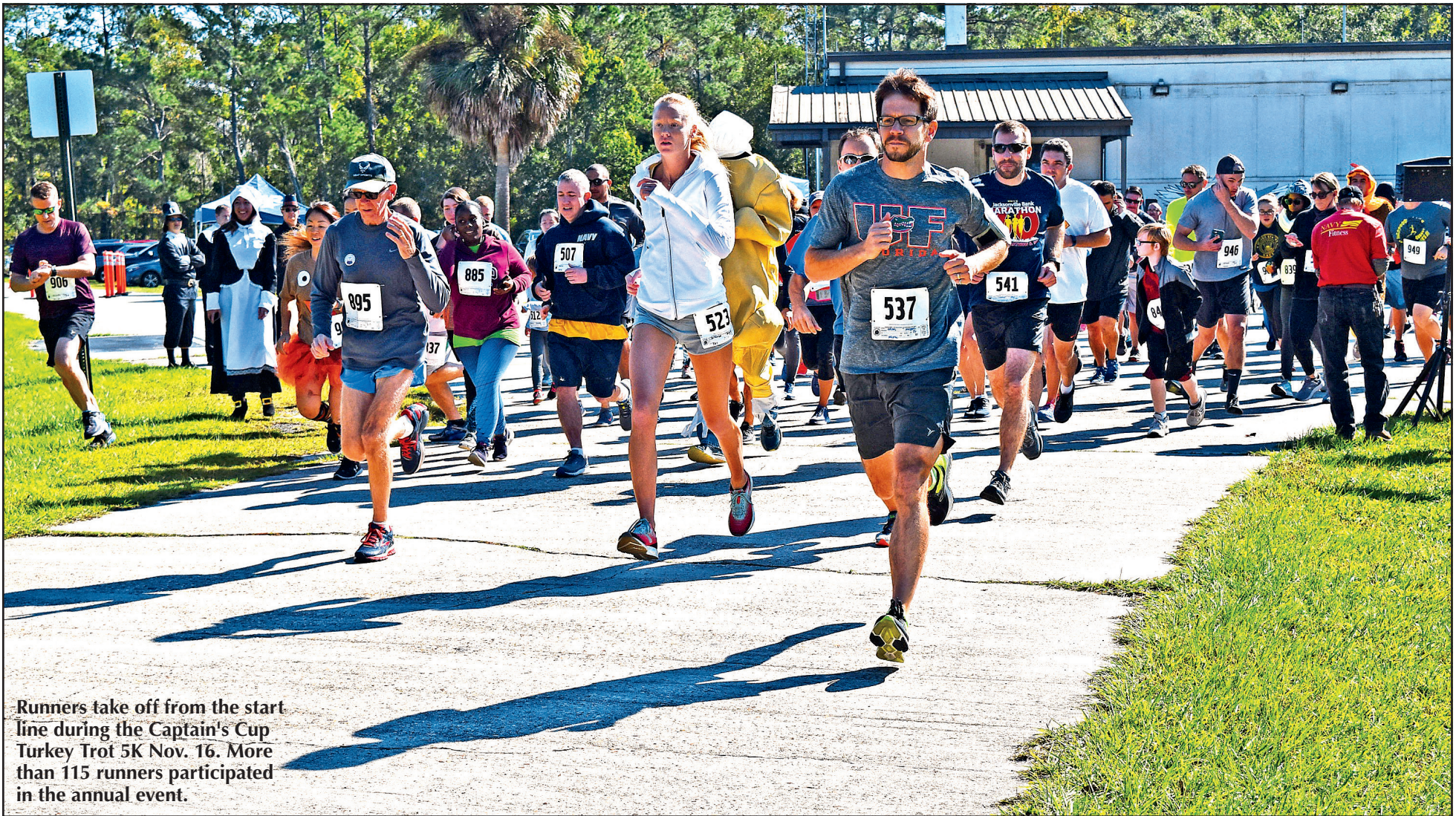
Runners take off from the start line during the Captain's Cup Turkey Trot 5K Nov. 16. More than 115 runners participated in the annual event.