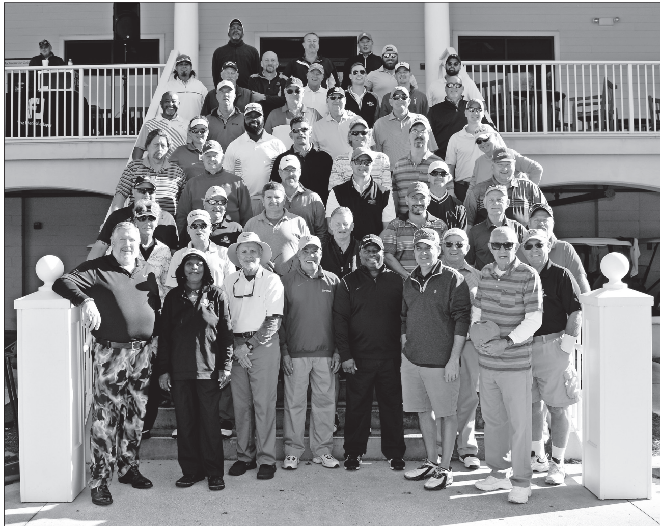
Golfers competing in the 15th Annual Turkey Trot Killer Scramble Golf Tournament gather on the stairs of the Naval Air Station Jacksonville Golf Clubhouse Nov. 21.