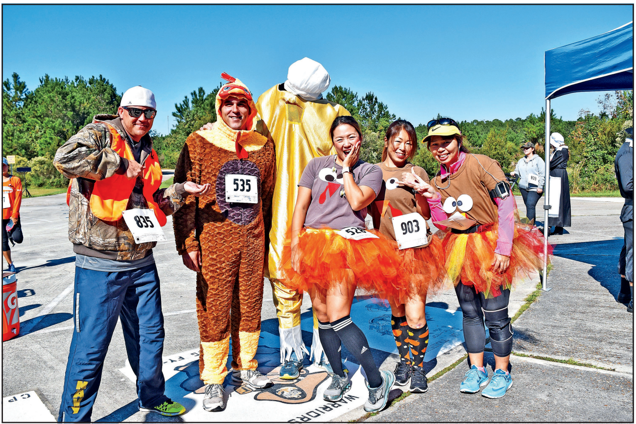
Runners display their Turkey Trot costumes during the 5K event aboard Naval Air Station Jacksonville.

Neither NAS Jacksonville, MWR nor Jax Air News or any part of the federal government, officially endorses any company or sponsor or their products or services.