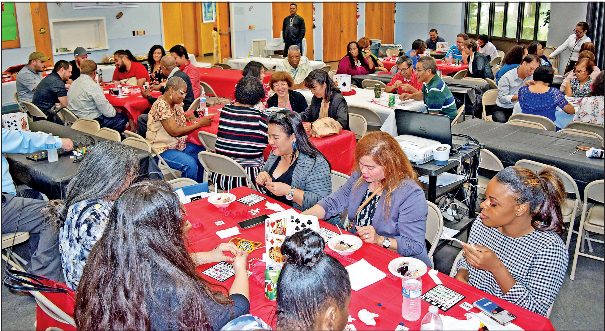
Employees of Navy Gateway Inn and Suites and Navy Getaways play games and Las Vegas-themed activities during the Navy Lodging Program Employee Appreciation Day Nov. 14 at the Naval Air Station Jacksonville Chapel.