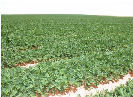
Figure 2. Peanut Production Field