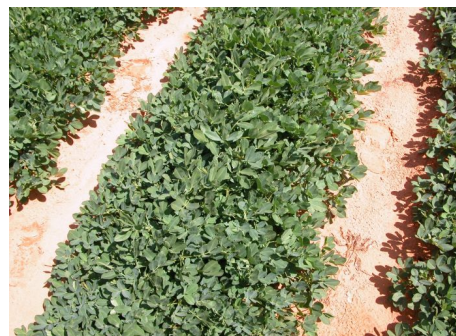
Figure 3. Peanut Production Field

Production costs for peanuts for the edible trade are well known. Yearly updates of production costs can be found at ( http://www.ces.uga.edu/agriculture/agecon/budgetsexcel.htm ). These budgets often show that peanuts cost from $800-1000/A to produce for non-irrigated and irrigated peanuts. If peanuts are to be profitable as a biofuel crop, a lower level of management would be necessary to reduce input costs at current fuel prices.