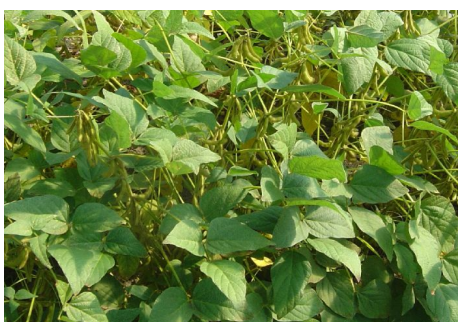
Figure 2. Soybean in vegetative state

knowledge is already in place for soybean and it is one of the easiest crops to grow because it makes a good rotation crop with corn or cotton. The procedure for processing these crops into oil is fairly simple and can be done on-farm with small extruders. Oil extracted from soybean can be washed with water and undergoes an esterification process which removes glycerin and allows the oil to perform like traditional diesel. Initially most of this biodiesel may be destined for use in farm equipment, but U.S. automakers are now embarking on small diesel engines in passenger vehicles, which will create more demand for diesel as well as biodiesel. Many tractor manufacturers already have warranties on tractors that use blends up to 5-15% biodiesel. Biodiesel provides power similar to conventional diesel fuel, is cleaner burning and has a higher lubricating effect than petroleum diesel.