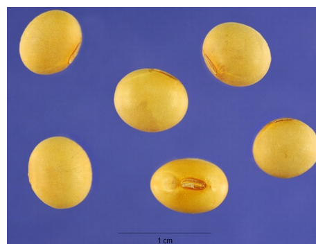
Figure 3. Soybean beans.

Soybean is a warm season legume crop that grows throughout the humid region of the United States. It grows to a height of 2.5-5 feet. Soybeans of maturity group V-VII are normally determinate, reaching near maximum height before flowering begins. This bloom period extends for 4-5 weeks. Beans in the pods develop over a 5-8 week period depending on the maturity of the soybean variety. Soybeans grow well on a wide variety of soil types. However, they are sensitive to water stress during the pod fill period. This period normally runs from late August until late September for maturity group V soybean and through October for MG VI-VIII beans.