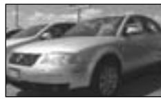
V6, sedan, 5 speed manual, Silver, Sunroof, Alloy wheels, under 46,000km