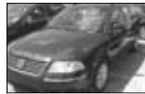
1.8T GLS Wagon, Blue, Automatic, under 80,000km, Sunroof and Alloy wheels

Fresh In, 2003 Passats With VW Certified Warranty.