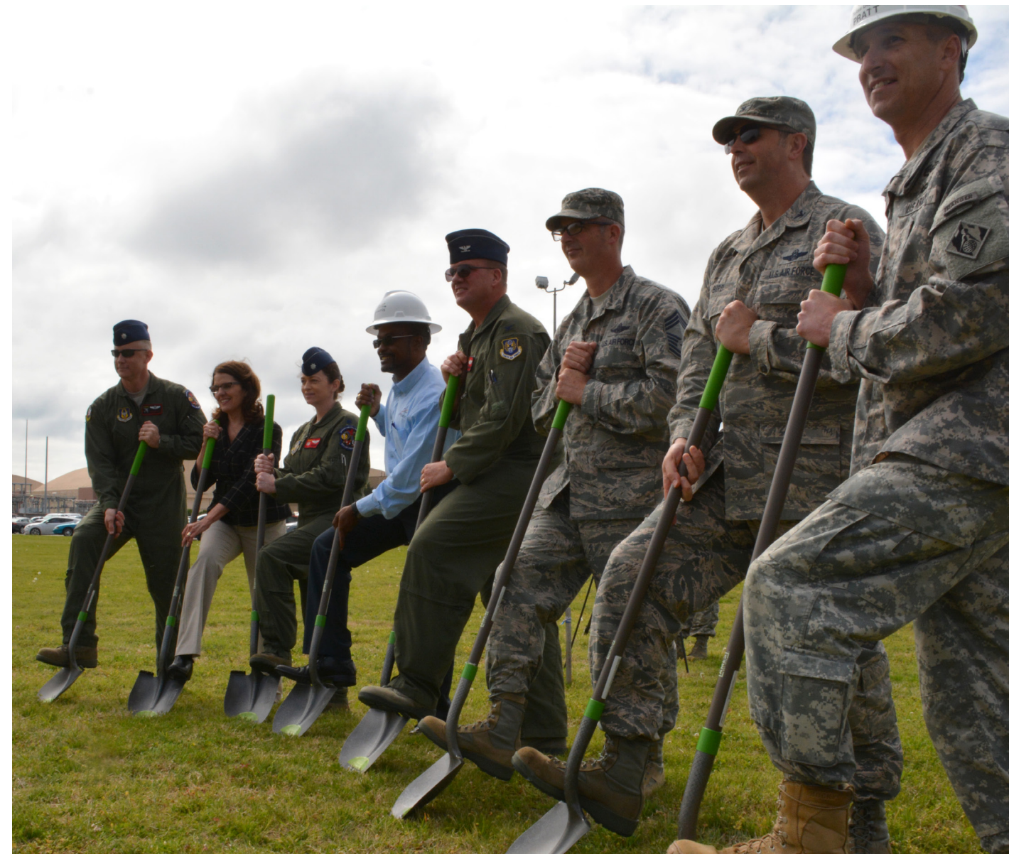
Officials from the 513th Air Control Group, Tinker Air Force Base, Air Force Reserve, Fortis Networks, Inc. and the U.S. Army Corps of Engineers gathered to break ground on the new 513th ACG operations facility April 14, 2016, during a ceremony in the field east of the 72nd Air Base Wing Headquarters, Bldg. 460. The 32,000 sq. ft. facility will allow the currently physically separated units to have a consolidated Air Control Group Headquarters, Operations Support Flight and Airborne Air Control Squadron facility.

for a larger and more up-to-date facility.