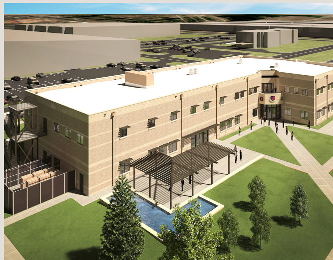
A rendering of the future 513th Air Control Group facility.

"The new building is a sign that the 513th will be around for the long term."