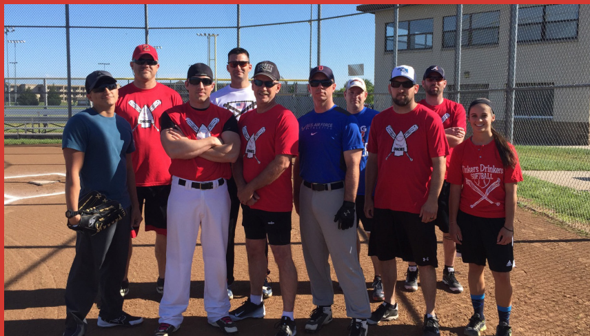
Members of the Okies softball team pose for a group photo May 12, 2016, at Tinker Air Force Base, Okla.

The Okies played with nine players, while the Thumpers began the game with seven, adding