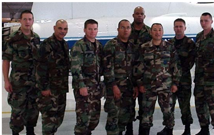
Six aerial porters from the 72nd APS pose with two members of the 433 ALCF from Lackland AFB.

True to their nature, this team of aerial porters dove into this mission with vigor and enthusiasm. Great care had to be taken to ensure all of NASA's cargo was properly inspected and ready for flight. Safety is always paramount for aerial porters. After the team inspected and prepared the cargo for airlift, they devised a load plan for a C-5, nicknamed "Fat Freddie" for its enormous size. The load plan included calculating weights and balances to properly distribute the cargo throughout the floor of the aircraft. All information was input into their laptops to produce the required documentation. When