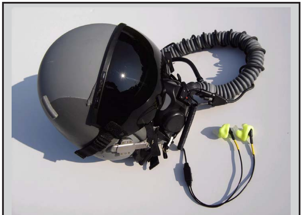
Air Force Reserve Command aviators will soon be wearing this custom fit earpiece. The ACCES helps to reduce noise by 40 decibels and provides clearer radio communication in the cockpit.

People can also lessen the impact of a potential fire, Powell said, adding that people with large acreages need to keep their property maintained, free of debris, hire professionals to keep tree limbs away from power lines and keep grass cut short. "It's a lot easier to put out a fire in short grass than one burning in tall weeds," he said.