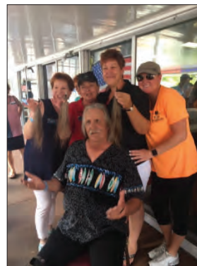
Ticket winners show their sections of Randall's hair.