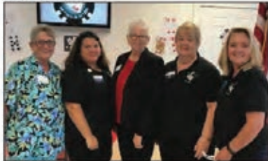
The Casino Bosses