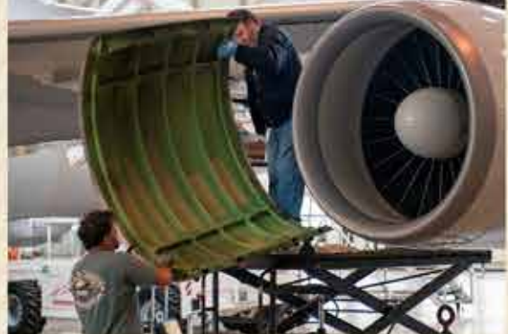
Teamwork at FOB Aktion during Technical Support Visit