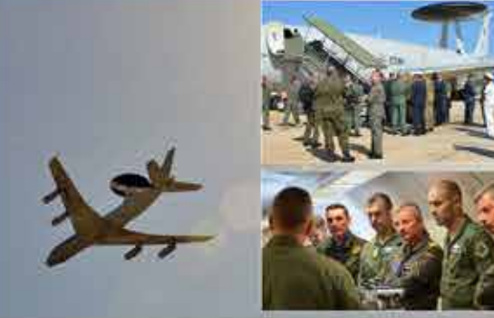
Transition Day Ceremony