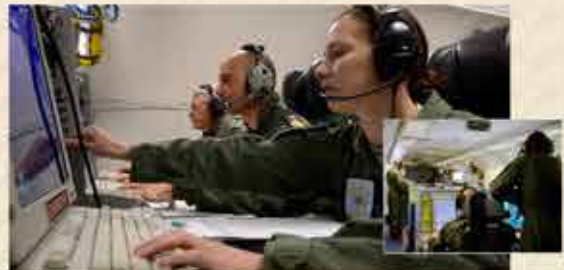
Arctic Challenge Exercise, FOL Ørland