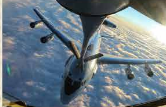
COMPTUEX: NATO AWACS integrates with US Navy

• Air National Guard takes media on an air-refuelling flight