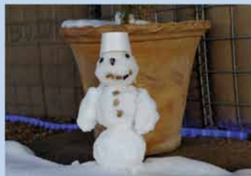
Merry Christmas to our deployed personnel

Merry Christmas and Happy New Year Frohe Weihnachten und ein glückliches Neues Jahr Vrolijk Kerstfeest en Gelukkig Nieuwjaar • Joyeux Noël et Bonne Année God Jul og Godt Nyttår • Buon Natale e Felice Anno Nuovo Glædelig Jul og Godt Nytår • Feliz Navidad y Próspero Año Nuevo Feliz Natal e Próspero Ano Novo • Boldog Karácsonyt és Boldog Új Évet Wesołych Świąt oraz Szczęśliwego Nowego Roku • Yeni Yılınız Kutlu Olsun Kala Christougena Eftichismenos o Kenourgios Chronos Veselé Vánoce a št'astný Nový rok • Craciun fericit și un An Nou plin de împliniri