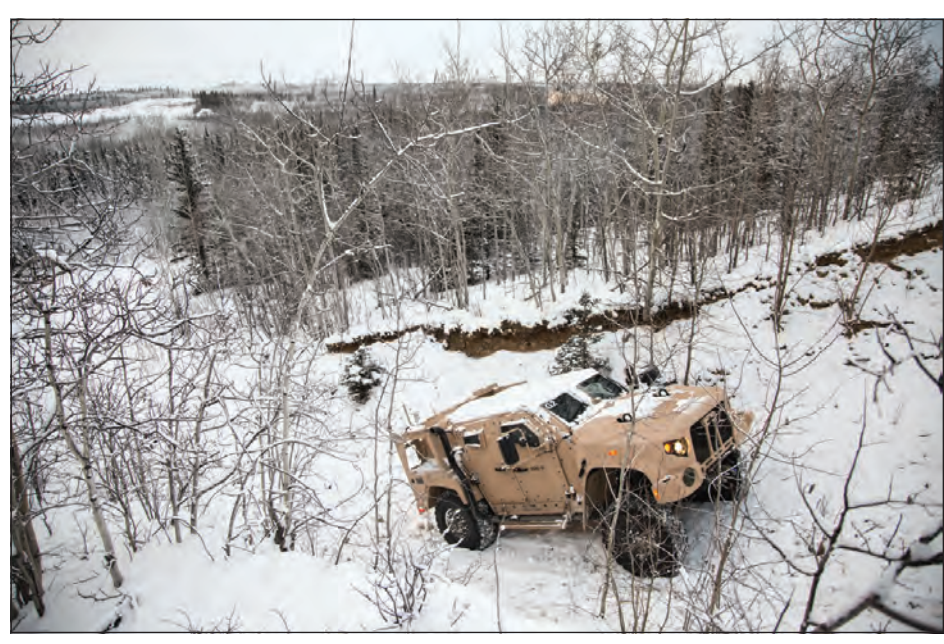
In addition to running the vehicles across 36,500 miles of paved, secondary, trails and cross-country roads at YTC, YPG testers are testing everything from the overhead gunner's protection kit to vehicle's active suspension system. The JLTV has also undergone testing at Cold Regions Test Center, as seen here.

The ravages of sand and dust are daily realities that must be planned for in places where American Soldiers are currently deployed. Though YPG has both in abundance, test items are subjected to controlled and sustained exposure of blowing silica powder or sand for six hours at a stretch, and are often put through their paces on the test range as soon as the punishing sand and dust blasting is completed.