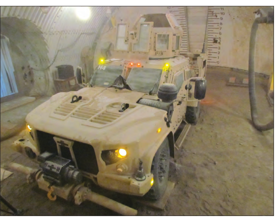
Among other things, the JLTV undergoes frosty conditioning in a cold chamber on post. The chamber itself is contained within a transition environment that buffers test personnel rooms from the extreme temperatures inside, and is outfitted with items such as cameras and air quality monitors.

The ravages of sand and dust are daily realities that must be planned for in places where American Soldiers are currently deployed. Though YPG has both in abundance, test items are subjected to controlled and sustained exposure of blowing silica powder or sand for six hours at a stretch, and are often put through their paces on the test range as soon as the punishing sand and dust blasting is completed.