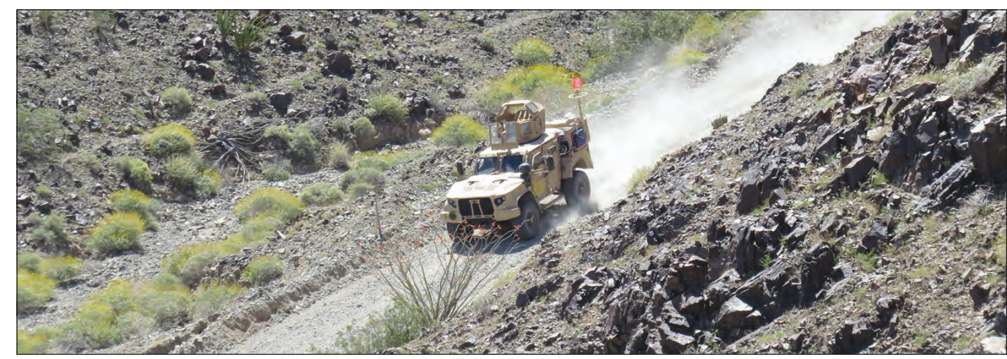
The Joint Lightweight Tactical Vehicle incorporates a long list of upgrades that will make it significantly more advanced than the current tactical vehicle fleet. It sports a height-adjustable, off-road racing inspired suspension, allowing the high-profile vehicle to be lowered to within inches of the ground to facilitate boarding and stowage on ships. Other notable improvements include embedded diagnostics, smart display units, and an automatic fire extinguishing system in the event the vehicle is subject to an improvised explosive device.

The JLTV's position is not an easy one, for the HMMWV is one of the most iconic wheeled vehicles in military history. Since its introduction in 1984 as the replacement for the equally influential Jeep, the versatile HMMWV has seen action in every