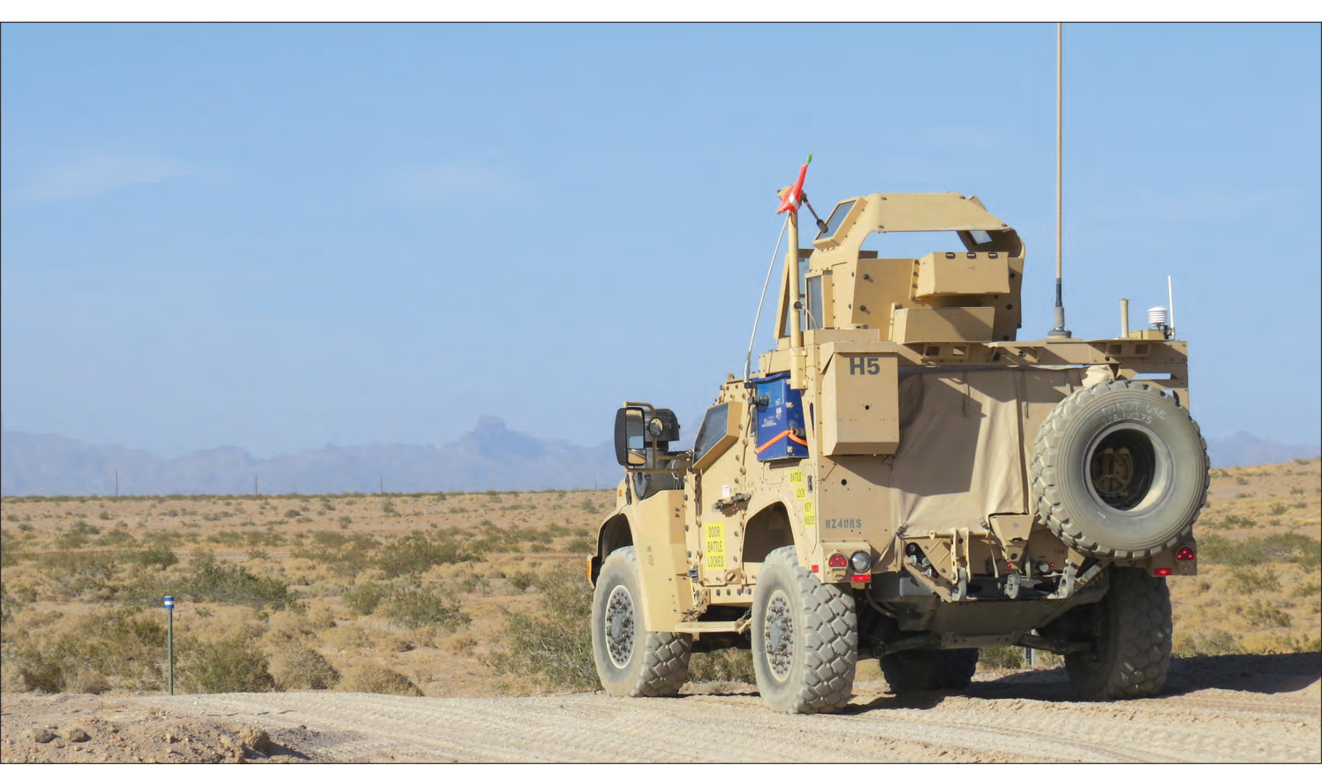
In addition to running the vehicles across 36,500 miles of paved, secondary, trails and cross-country roads at YTC, YPG testers are testing everything from the overhead gunner's protection kit to vehicle's active suspension system.

The Services are in the process of developing and refining their respective tactical wheeled vehicle strategies, therefore a final