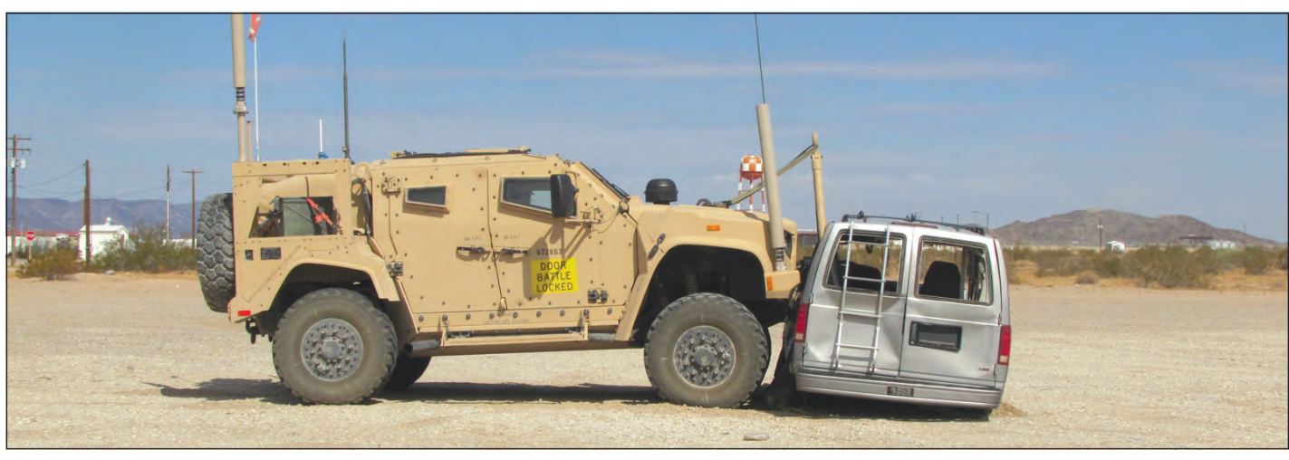
The JLTV is a powerful vehicle that can overcome large obstacles with ease. Currently, the Army intends to purchase 55,000 JLTVs within the next 15 to 20 years.

The Multi-Service Operational Test & Evaluation (MOT&E) event for the JLTV program is scheduled for earlier next year, and Rodriguez praises the efforts of all YPG personnel involved in the test, from the test officers to the support groups who worked long days to ensure the test execution was performed as required to support entry for the MOT&E event. "It's all hands on deck," he said. "The entire team is making a valiant effort to meet the program's schedule expectations while ensuring all test requirements are fully assessed safely and as efficiently as possible."