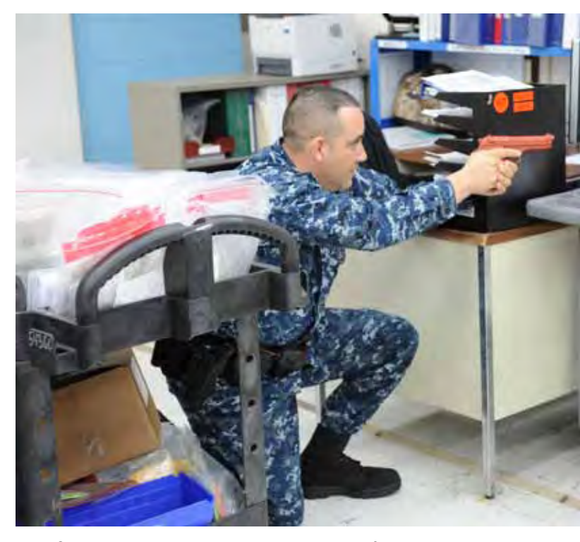
Navy Security use mock weapons as they search for the active shooter during a drill exercise.

The simulated shootout was staged in a work area of one of CCAD's main facilities. A volunteer from the United States Coast Guard played a terminated employee who returned to work angry and armed for revenge. Four depot employees volunteered to be victims of the bloody shootout.