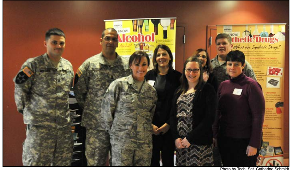
New York Army National Guard Counter Drug Task Force members and Northeastern New York Prevention Cooperative representatives hosted the Alcohol and Substance Abuse Treatment Prevention and Recovery Conference at the Naval Operations Support Center in Glenville, New York, on Oct. 28, 2015. More than 100 community anti-drug program members attended the conference.

"When we all come together, we can be working on the same sort of mission in all