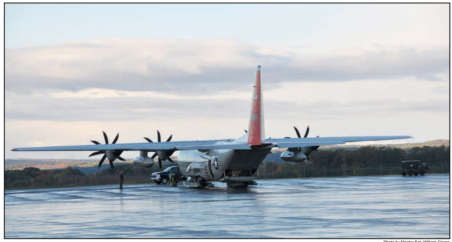
An LC-130 Skibird and aircrew with the New York Air National Guard's 109th Airlift Wing departed Oct. 16, 2015, from Stratton Air National Guard Base, New York, for McMurdo Station, Antarctica. This is the 28th season that the unit has participated in Operation Deep Freeze, the military component of the U.S. Antarctic Program, which is managed by the National Science Foundation.

The 109th AW has been supporting the NSF's South Pole research since 1988. Since 1999, the unit has been the sole provider of this type of airlift to the NSF and U.S. Antarctic research efforts.