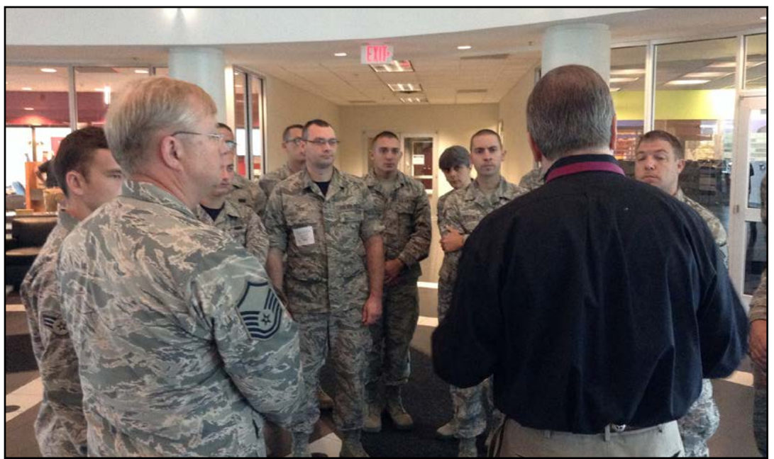
Airmenwith the 109th Communications Flight visited the State University at Albany College of Nanoscale Science and Engineering on Aug. 21, 2015.

Some ideas discussed included using micro technology to perform research at the South Pole, developing micro-drones for research and weapons, and creating micro tools to perform maintenance on the base network infrastructure or even aircraft maintenance.