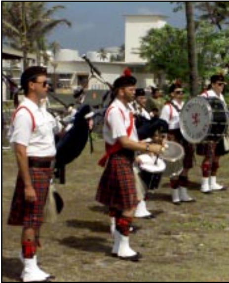
The Kwajalein Pipes and Drums plays "Amazing Grace."