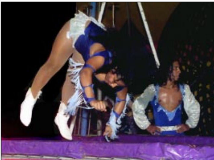
Above: This acrobat takes trampoline jumping to new heights with her amazing agility and grace.