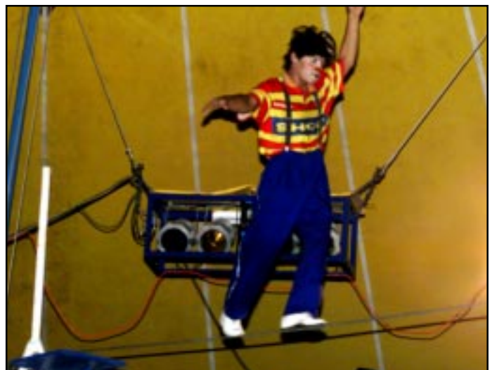
Tequila stops clowning around long enough to dazzle the crowd from the high wire.