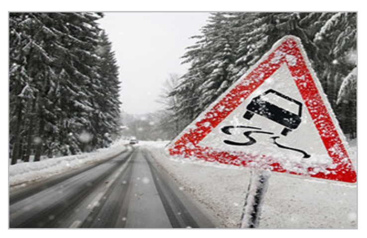
During inclement weather conditions, check the U.S. Army Garrison Benelux website and official Benelux Facebook pages to get current information.

Driving and road conditions do not dictate whether you should come to work, they are indicators that you