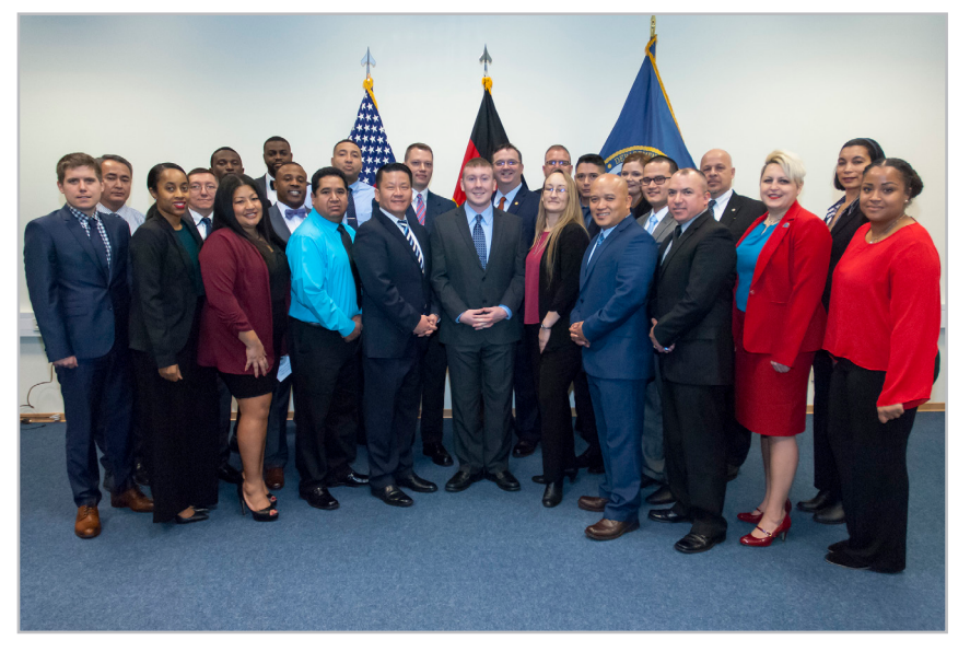
Thirty-three transitioning service members graduated last month from the U.S. Department of Veterans Affairs' first overseas Warrior Transition Advancement Course at U.S. Army Garrison Rheinland-Pfalz, Germany. Along with certificates came well-earned job offers with the VA.

The next round of WARTAC classes are scheduled at garrisons Bavaria and Rheinland-Pfalz from Feb. 28 to May