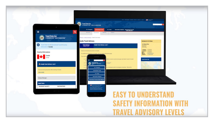
Graphic courtesy of U.S. Department of State: Consular Affairs.

Enrollment in the DoS Smart Traveler Enrollment Program, or STEP, is mandatory for U.S. European Command personnel