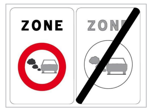
Road signs indicate entrances and exits of the Low Emission Zone in the Brussels Capital Region.

A transition period of nine months will allow drivers to adapt to the new system. In October, an administrative fine up to €350 will be sent to drivers whose cars fail to meet the access criteria. The control of the access criteria is monitored by "smart cameras."