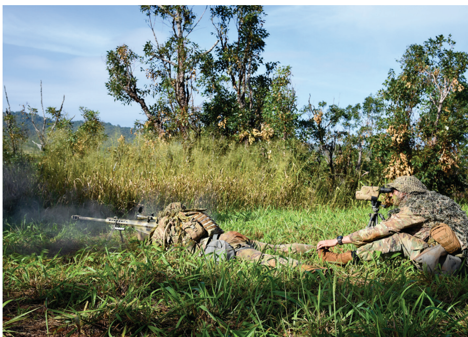
Soldiers from the 1st Bn., 27th Inf. Regt., 2nd IBCT, 25th ID, train at a site that is new to them on Schofield Barracks. Training in a new environment enhances real-world fighting experience and critical thinking skills.