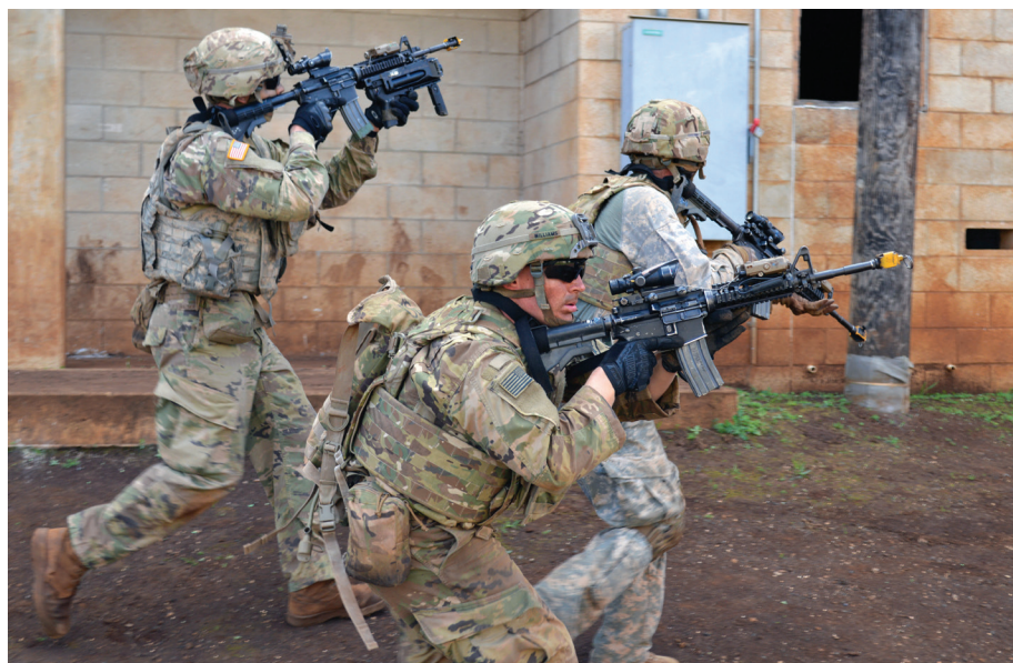
Infantrymen assigned to 2nd Bn., 35th Inf. Regt., 3rd BCT, 25th ID, scan and rush to their objective during squad room-clearing training at Schofield Barracks, Dec. 5.