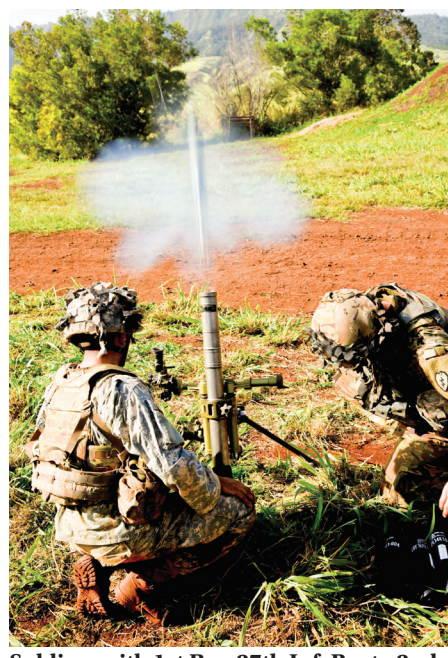
Soldiers with 1st Bn., 27th Inf. Regt., 2nd IBCT, 25th ID, participate in a cold-hit site combined arms live-fire exercise on Schofield Barracks.

Infantry units have fire direction center teams to ensure that the rounds which