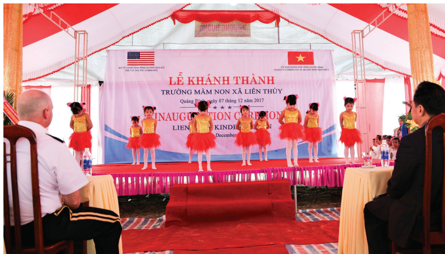
Local children prepare for their dance routine during a ribbon-cutting ceremony for a U.S.-funded kindergarten, Dec. 7, in Lien Thuy, Vietnam.

Right — Locals take a tour of a new U.S.-funded kindergarten in Lien Thuy, Vietnam, Dec. 7. The 10-room kindergarten can support the education of 320 children and doubles as a storm shelter. USARPAC has built 20 schools in Vietnam since 2009 using OHDACA and Civic Aid funds.