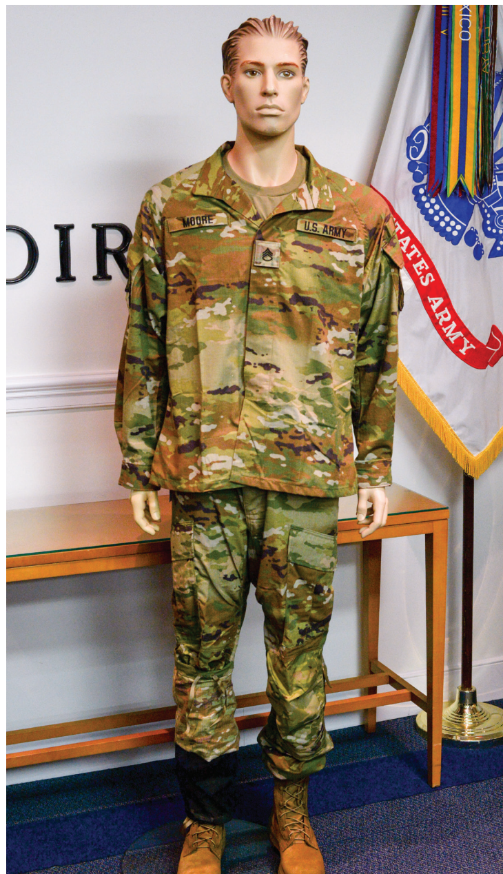
Program Executive Office Soldier officials discussed improvements to the hot weather uniform (above) and jungle combat boot (below) programs during a media roundtable event on Fort Belvoir, Virginia, Dec. 7. The 25th ID is slated to field test the new uniform and boot starting in January.

Furthermore, he said, all the Version 2 boots are better designed to not hold in any moisture, and incorporate larger-sized drainage vents on both sides. Come January, the Version 2 boots - 150 from each of five manufacturers - will be distributed to 25th ID Soldiers to be field-tested until March. The goal is for this current evaluation of Version 2 boots, and subsequent feedback, to be combined into a final offering.