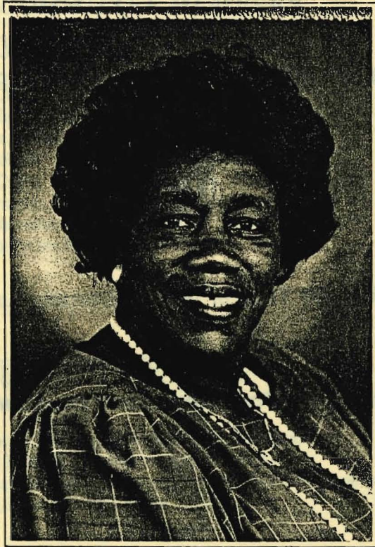
THE FIRST BAHAMIAN NURSE EDUCATOR 1966