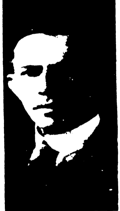
Dr. Harmodio Arias

Una frase muy gráfica del periodista español Sr. Ramiro de Maeztu acerca del Señor Pueyrredón