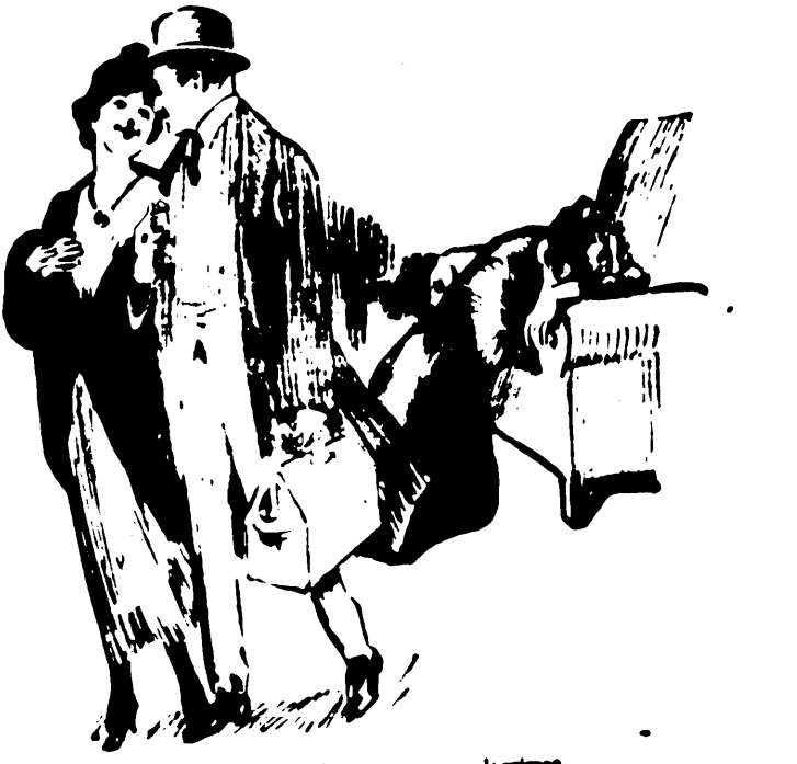
Otra luna de miel que termina en lágrimas por faltarle a la esposa sangre roja y sana.