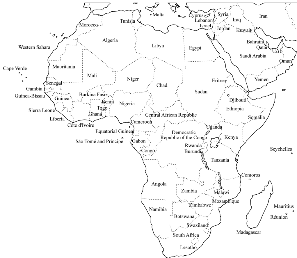
Figure 1.1: Africa

This area extends from far west Africa across the Sudanic plain as far east as the Lake Chad environs, then down to the equatorial district as well as central, east and south Africa and the major islands. This very large spread of land has many and varied peoples and cultures, but historical material is still relatively meager for most of it and from the standpoint of manuscript space, it seems best to consider it under one section.